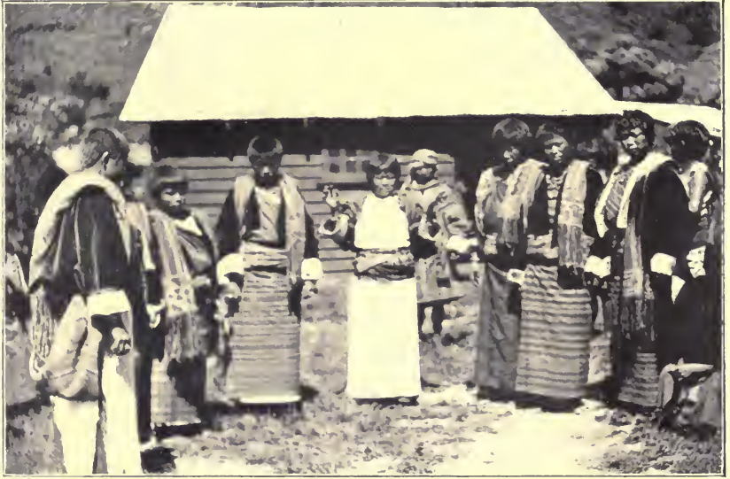
“ THE LADIES OF THE HAMLET CAME FORWARD.”